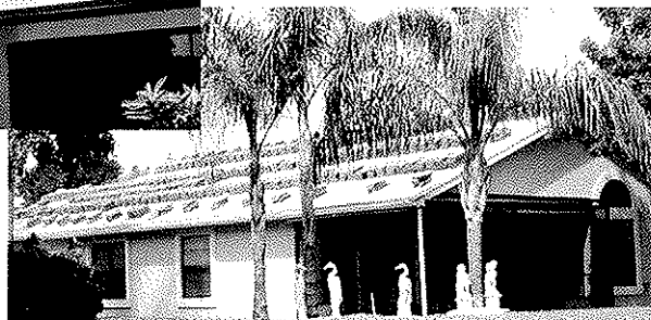
The underlayment's mineral-surfaced topside provides a safe surface for stacking tile and provides traction for roofers.

is one major difference: No hot-mopping of asphalt is required for its installation. The bottom side and the side-lap seam have a self-adhering compound of high-tack, SBS-modified asphalt, which is protected by a release film for easy installation."